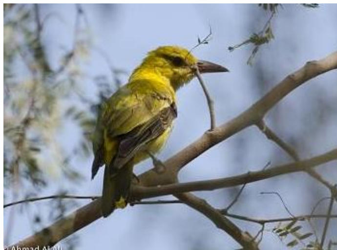
Left: White-rumped Sandpiper Calidris fuscicollis , Al Ain Water Treatment Plant Right: Black-naped Oriole Oriolus chinensis , Safa Park