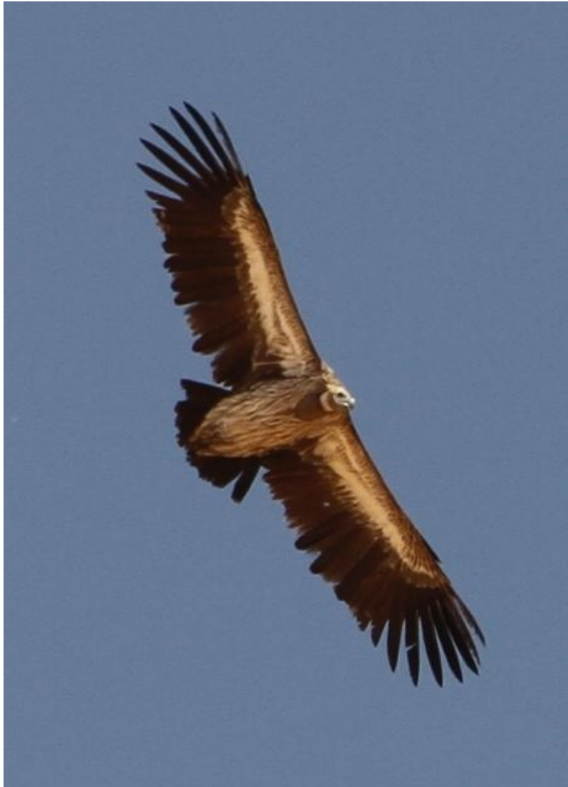
Himalayan Griffon ( Gyps himalayensis) – 1 st record for Arabia found at the Dubai Desert Conservation Reserve in October 2012.