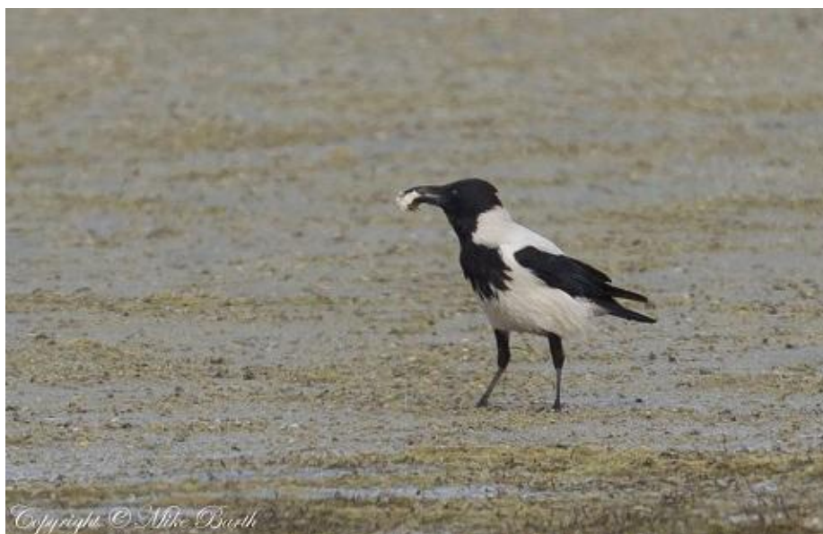
Mesopotamian Crow Corvus cornix capellanus , Khor Al Beida