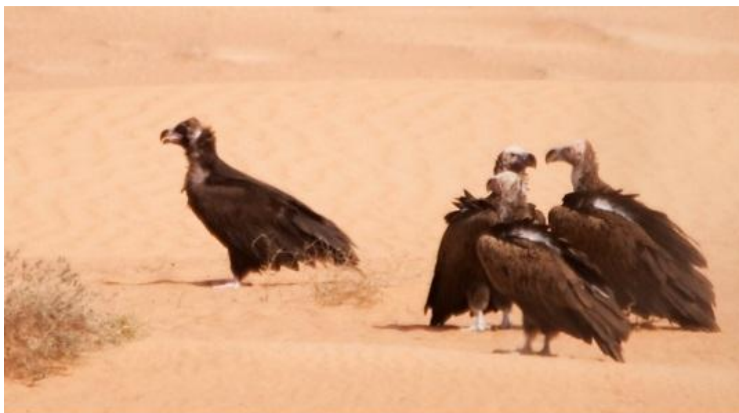
Cinereous Vulture Aegypius monachus with Lappet-faced Vultures Aegypius tracheliotos , Dubai Desert Conservation Reserve