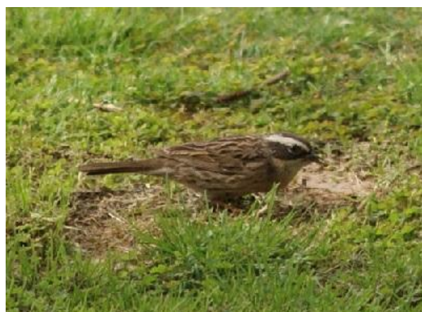
Left: Himalayan Griffon Vulture Gyps himalayensis Dubai Desert Conservation Reserve Right: Radde's Accentor Prunella ocularis Safa Park