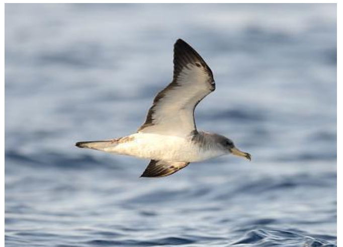
Left: Black-legged Kittiwake, Rissa tridactyla , Fujairah Port Beach, © Simon Lloyd Right: Cory's Shearwater, Calonectris borealis , Kalba deepwater pelagic, © Huw Roberts.