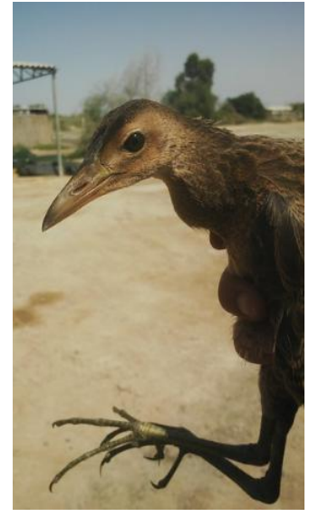
Left: Black-winged Kite Elanus caeruleus , Dubai Pivot Fields, © Mark Smiles Centre: Large-billed Leaf-warbler Phylloscopus magnirostris , © Mark Smiles Right: Watercock Gallicrex cinerea , Nad al-Sheba © Gareth Tonen