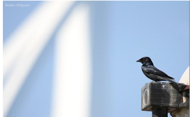
Left: Immature Masked Booby Sula dactylatra , Khor Kalba pelagic, © Khalifa Al Dhaheri Right: Black Drongo Dicrurus macrocercus , Umm Suqeim Park, © Badder Al Qasimi