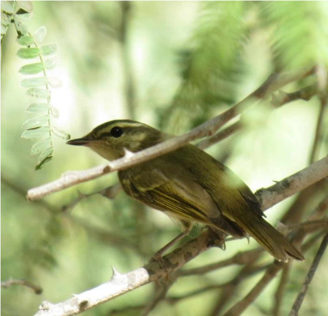
Large-billed Leaf Warbler ( Phylloscopus magnirostris) – 1 st record for the UAE and Arabia found at Al Mamzar in October 2014.