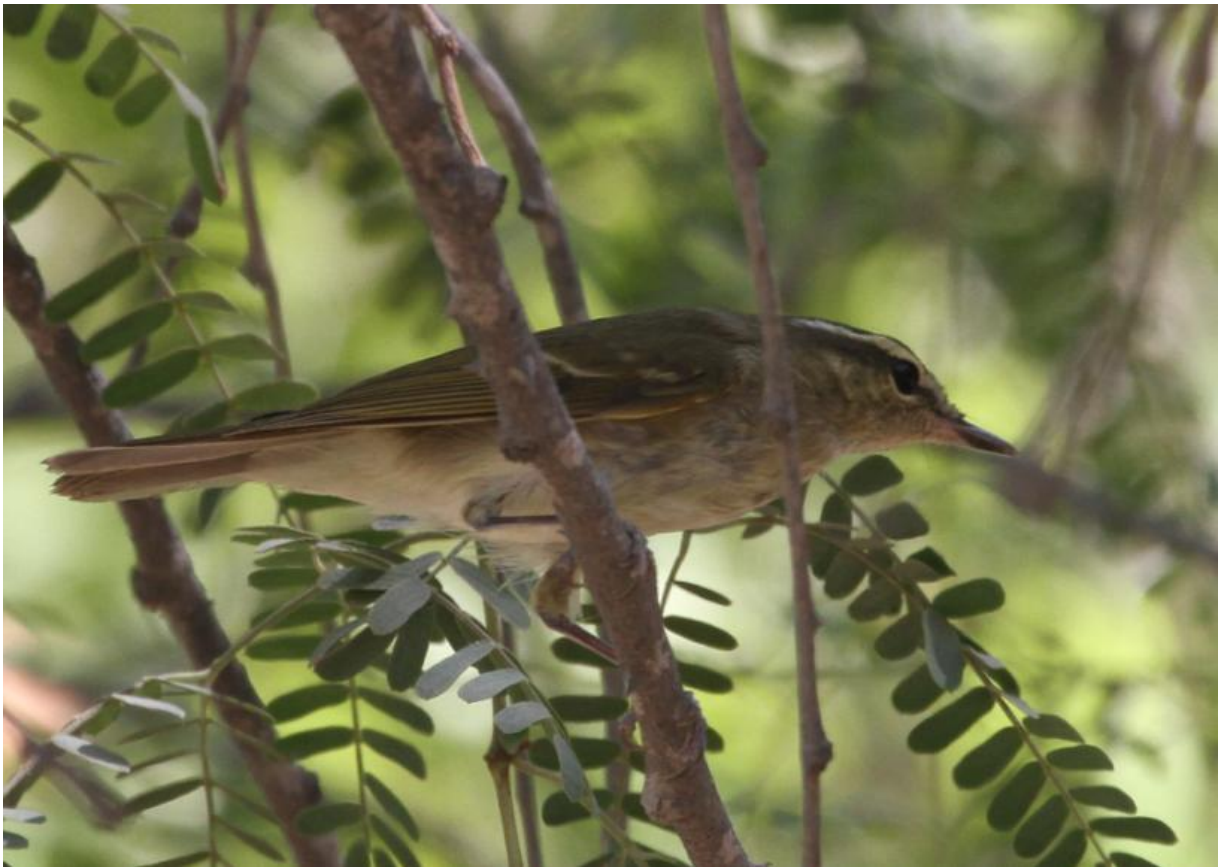
Large-billed Leaf-warbler Phylloscopus magnirostris