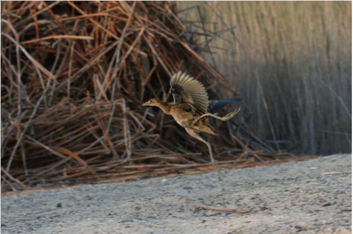
Watercock Gallicrex cinerea , Warsan Lakes