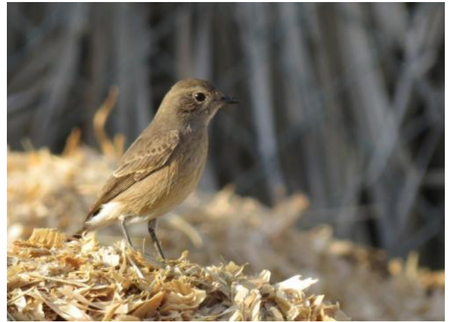
Left: Fan-tailed Raven Corvus rhipidurus, Al Samha petrol stations, Right: Pied Stonechat Saxicola caprata, Abu Dhabi Golf & Equestrian Club